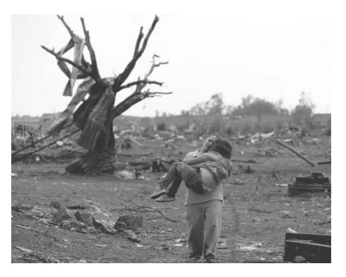
FIGURE 3. Carrying children in the arms or on a hip with the use of an arm takes much more energy than carrying a child in a sling and denies the carrier the use of at least one arm for other purposes, such as foraging. This photo, which shows a woman carrying a heavy child after a school collapsed in Moore, Oklahoma in May 2013, demonstrates how crucial carrying children can be, regardless of their weight and the lack of easier ways of transporting them, when adults have to take children very far during moves or emergencies.

The study also demonstrated that carrying an infant without a sling for more than a few minutes at a fast walk was energetically unreasonable, and that mothers lose so much energy when carrying heavier juveniles at such speeds that the costs approach those of lactation