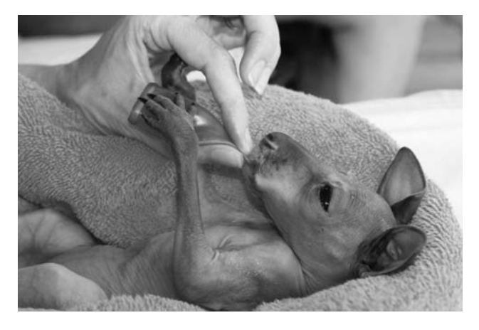
FIGURE 8. A 4-month old red kangaroo is completely bald. This makes it easier for its mother to clean it by sticking her snout into her pouch and licking off its urine and excrement.

The most obvious analogy for hominin babies after they adapted to slings is kangaroo joeys. A kangaroo mother has to clean both her pouch and baby (while it remains attached to a teat in the pouch for 70 days) by licking away its urine and excrement (Claiborne Ray 2012). If these wastes were left to fester in the pouch's warm humid interior, they would endanger both the mother and joey. Baby red kangaroos, to give but one example, have adapted to such potentially infectious conditions by remaining absolutely bald for over 4 months (Zooborns 2009) ( Figure 8 ), which makes them easier to clean.