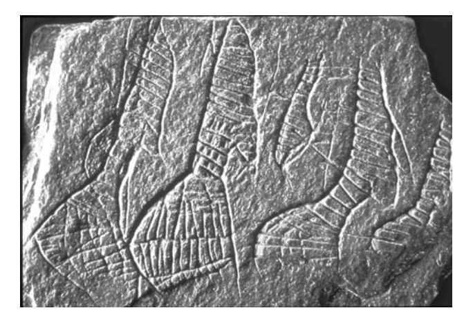
FIGURE 7. This Magdalenian engraving from Gönnersdorf, which shows a female anthropomorph with a smaller one linked to her back, probably represents a woman with an infant in a papoose-like device.

Despite the fact that there might not be any exact equivalents for the first slings among modern baby containers, there is considerable evidence for the antiquity of baby-carrying devices since the invention of compound tools, weaving and leather. The oldest fairly clear evidence is a Magdalenian engraving from