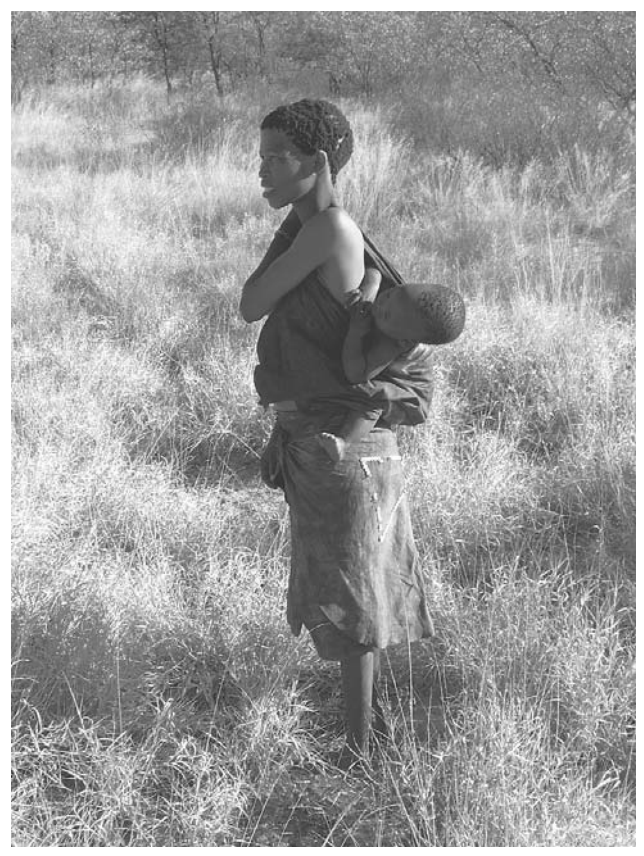
FIGURE 6. San/Bushman women, like this one near Ghanzi, Botswana, use leather slings for transporting food and infants. Older infants can ride on top of the slings, with the support of a maternal arm, when the flexible containers are stuffed with gleanings (Severin 1973: 164).