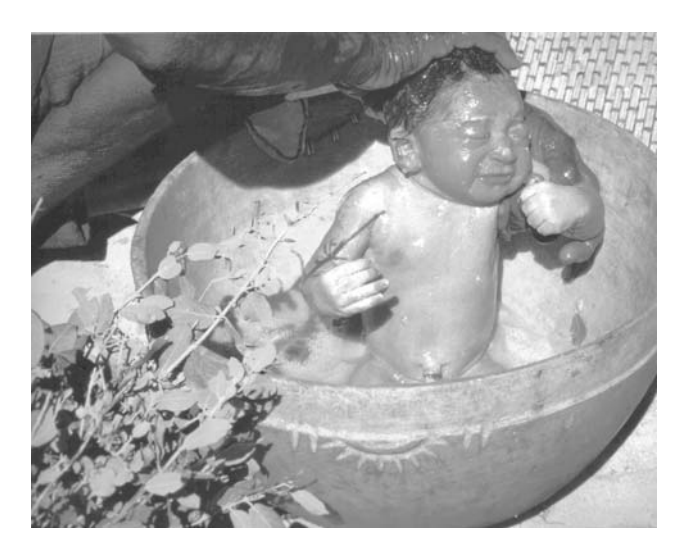
FIGURE 10. Modern infants, such as this newborn Wodaabe girl, tend to be washed daily, if not more often. Many of the studies of mirroring behaviors between mothers and their infants correspond to such moments, when they tend to be face-to-face. Adopted from Beckwith and Fisher (1999: 21), courtesy C. Beckwith and A. Fisher.

The first of these directions concerns the intervals between an infant's sessions in unsanitary containers, when a mother would have had to clean, and just as importantly, in light of the bacterial blooms caused by such confinement (Suter et al. 2011), dry infants. These intervals correspond to the daily, and often more frequent, bath times of modern infants (Falk 2009: 25) (Figure 10), when so much of the face-to-face and kinesthetic interaction between mothers and their offspring that has been described by Stern (1985), Eibl-Eibesfeldt (1989), Bråten (2004), Trevarthen, and others takes place. Although such interaction also occurs during bottle feeding (Schögler, Trevarthen 2007: Fig. 3), it is not so much the case with breast-feeding. The feeding of solid foods, which often meant the mouth-to-mouth passage of food masticated by mothers even after the invention of cooking and gruel (Forge, Evans-Pritchard