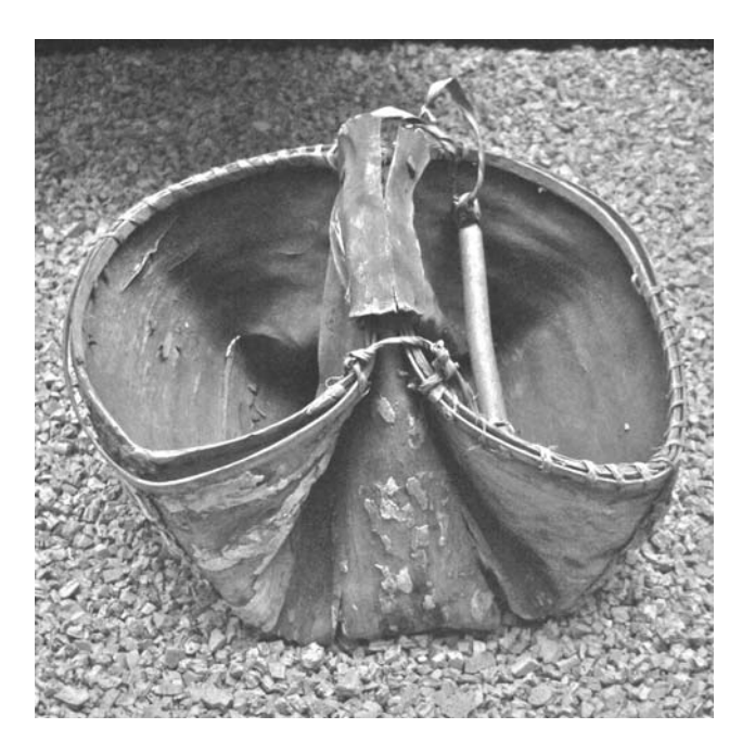
FIGURE 5. Even the simplest ethnographically known plaited baskets like this Ojibwa specimen made of elmbark or similar ones made of leaves by Australian Aborigines (Rossbach 1973: 22, Fig. 18) are complex, since they often include drilled holes, cordage, rigid frameworks, and multiple parts, such as separate containers and handles, which make them compound tools. These complications show how many innovations had to be mastered to make most of the sturdy plaited containers known today. It also suggests that it would have been harder for the first makers of baby-carrying devices to make strong ones from plants than to make them out of hides with either natural or artificial holes. Photo by the author. American Museum of Natural History, New York.

Could there be ethnographic evidence for the supposition that the first baby containers were often made of unsanitary skins? Probably not for two reasons. The first is that so many ethnographic examples are made out of a recent invention, cloth (Blois 2005: 30–31), which breathes better and is lighter than hides, while modern hide slings, like ones used by the San (Falk 2009: 34), are usually made of true leather ( Figure 6 ).