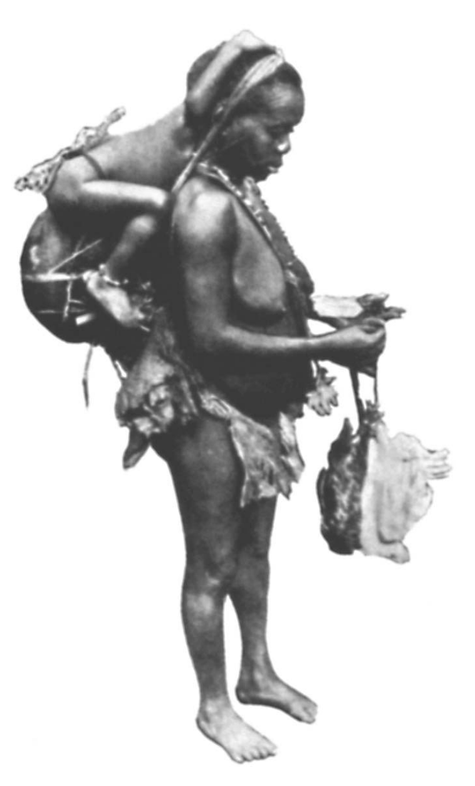
FIGURE 2. Once humans acquire tenacious clinging reflexes at least 6 months after birth, they can hold onto adults' neck, scalp, or carrying gear. This permits women like this Pygmy mother to use their carrying devices for other things than carrying infants. Hominins probably had to develop particularly strong reflexes within weeks of birth before the invention of slings, because they had to defy gravity more than baby chimps, who not only have grasping hands, but clasping feet, and can ride adults' horizontal backs. The need for such strong reflexes probably forced bipedal hominins to be born with particularly mature brains until the invention of slings. This cerebral maturity probably prevented brains from growing as much post-natally as those of later hominins, who used slings.

neonate reflexes include vestigial hand-and-footgrasping reflexes – none of which are strong enough to hold on for long and disappear within a few weeks, as