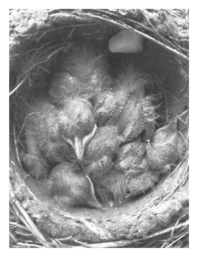
FIGURE 9. Young passerine birds like these robins resemble baby humans in several ways. These include loud cries that seem to have evolved in response to their need to draw attention to themselves in nursery-like environments, nearly bald bodies, which reduces hiding places for parasites, and richer diets than their precocial cousins. Altricial birds have also evolved the avian equivalent of diapers – faecal sacs, one of which can be seen at the top of the photograph. These sacs allow adults to remove their chicks' wastes from the confined environment, where they could increase the risk of infection by providing nutrients for microbes.

Paradoxically, precocial species show a trade-off between their juvenile and adult brain sizes, since they hatch with more fully developed brains than altricial species, only to end up with smaller skill sets and adult brains in relation to their body weight (Ehrlich et al. 1988). Similarly, newborn apes have relatively mature brains by comparison to their human counterparts, but their brains never grow as big or complex as a human's, making apes more precocial than Homo sapiens .